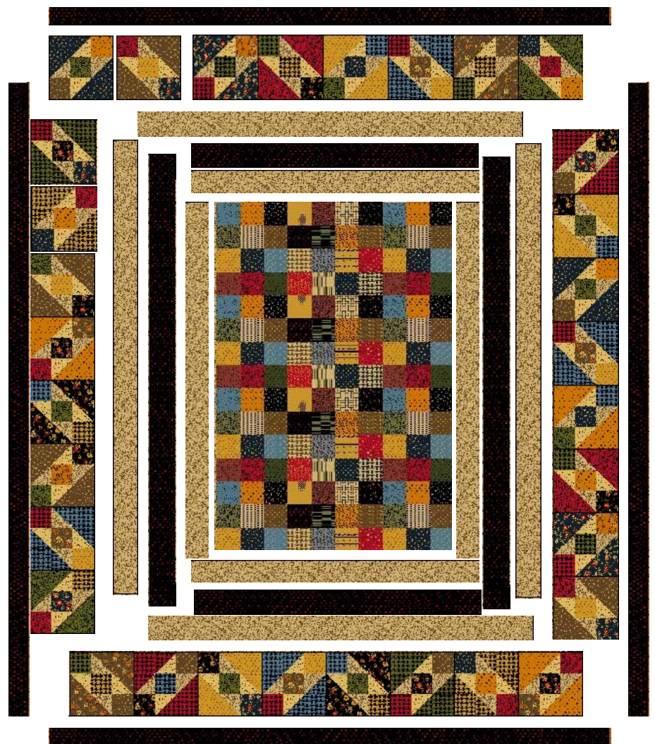
Quilt Assembly Diagram